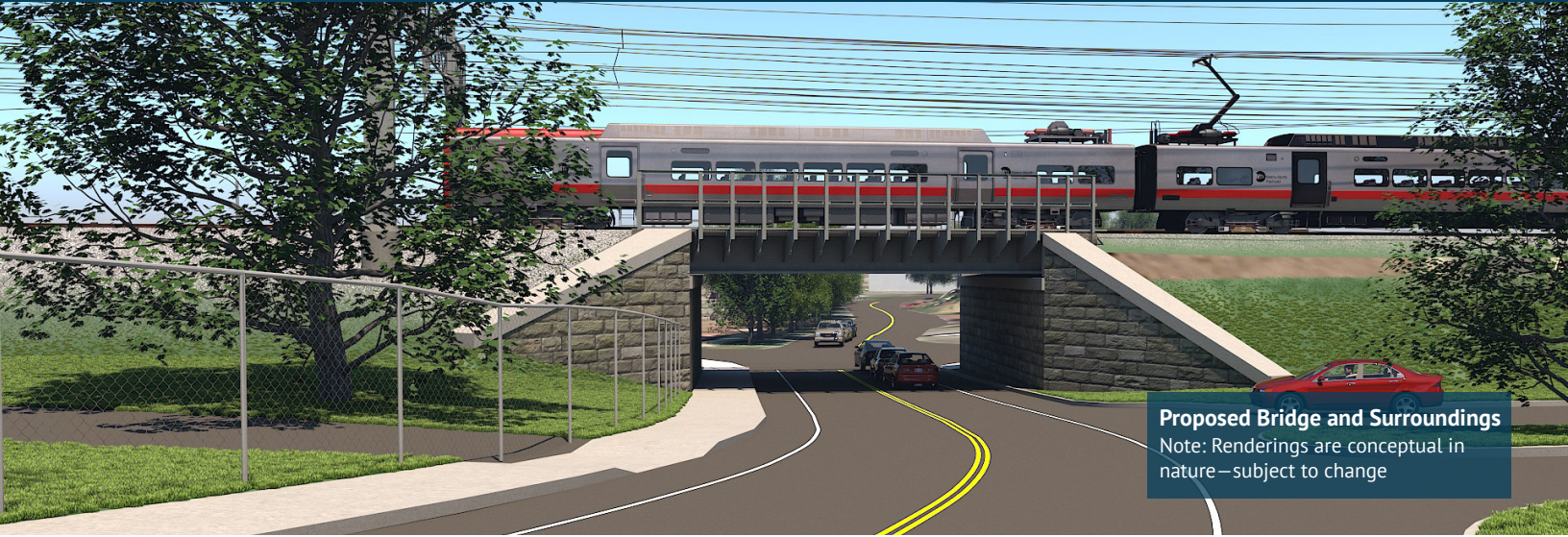
Proposed Bridge and Surroundings Note: Renderings are conceptual in nature—subject to change

The New Haven Line passing through Norwalk relies on infrastructure from the 19th century. To modernize, this project replaces the Fort Point Street bridge and the neighboring walls supporting the track. The project realigns Fort Point Street with S. Smith Street, increasing safety and improving visibility for drivers and pedestrians.